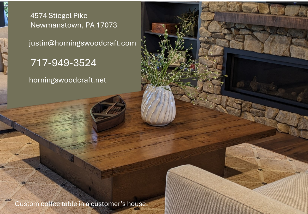
Custom coffee table in a customer's house.